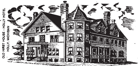
OLD FIRST HOUSE - HOLLY HOTEL HOLLY, MICHIGAN